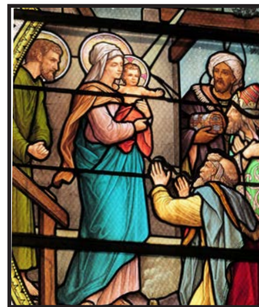
THE ADORATION OF THE MAGI. L'Église Notre-Dame de Passavant-la-Rochère.

The visit of the Magi shows that Jesus is the true King for all Nations, and that those who sincerely seek Him, such as the Wise Men, find light and joy. Those who fear Him, such as Herod, remain in darkness.