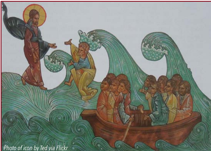
Photo of icon