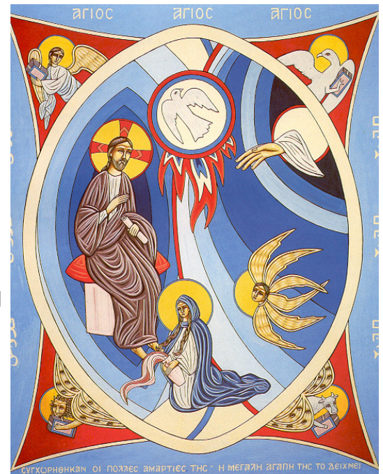
TRINITY SUNDAY. The Maronite Icons: Modern Sacred Art. Dar Sader Publishers: Beirut 1999.

When they saw him, they worshiped, but they doubted. Then Jesus approached and said to them, "All power in heaven and on earth has been given to me. Go, therefore, and make disciples of all nations, baptizing them in the name of the Father, and of the Son, and of the holy Spirit, teaching them to observe all that I have commanded you. And behold, I am with you always, until the end of the age."